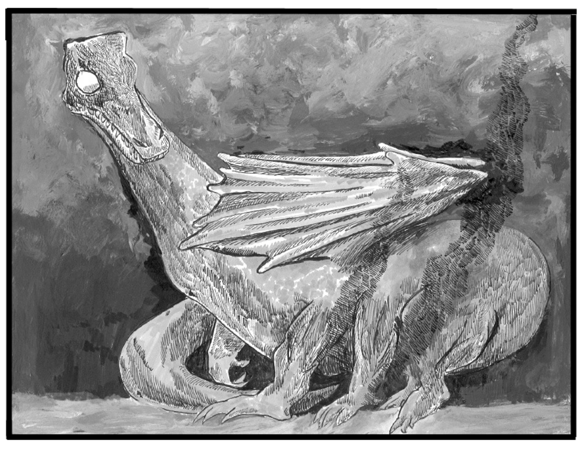
Original Artwork: 'Commode Minstrels in Bullface' collective (Drakeling pic) Odkin Prospect section (p33) by Sarah Wroot Printing: pp1-33 = Duplex; pp34-37 = single-sided

('Footsteps of Fools': Episode 6 - www.pelgrane.com/violetcusps.htm)